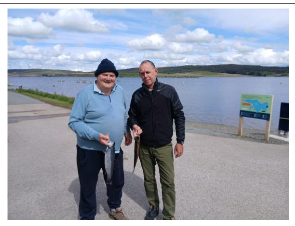
Two happy anglers after a day at the Brenig.