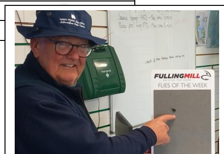
Paul's Fly of the Week Foam daddy with UV strand