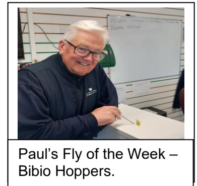
Paul's Fly of the Week – Bibio Hoppers.